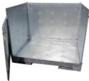
Option 1 : large sides are removable. Remove 1 large side Do not forget to hinge back the sides when the operation is finished