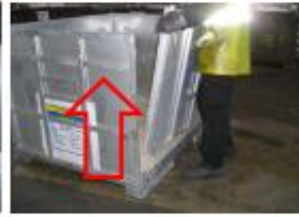
Step 3: Pull up the left part of the long side