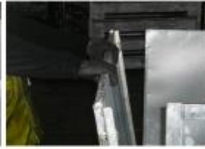
Step 2: Pull the long side towards you