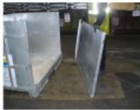
Step 4: Slide the long side to the left so as to free the bottom right pinion and remove the side completely

Protocole of usage F400PFPD English Date : 20/06/2018 Rev. 1.1