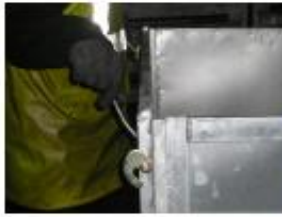
Step 1: Unlock the latches